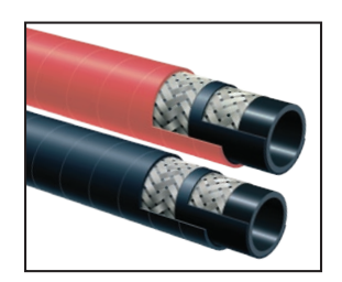
T341 Series Chlorobutyl Steam Hose