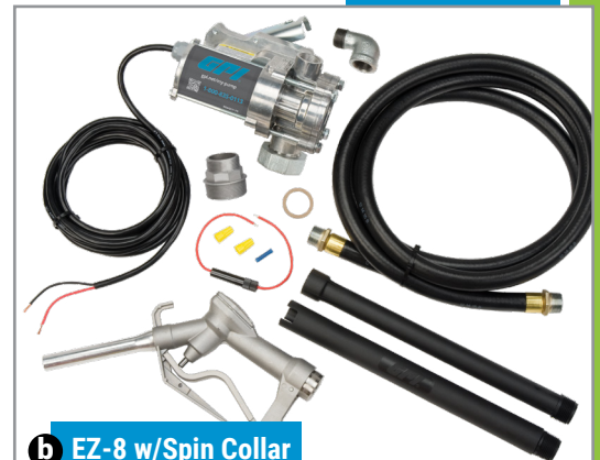
b EZ-8 w/Spin Collar